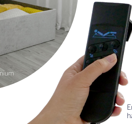
Ergonomic hand controls