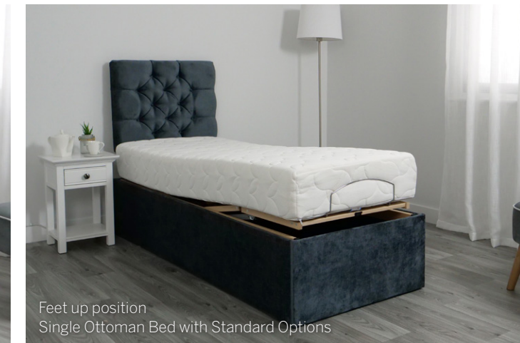
Feet up position Single Ottoman Bed with Standard Options

For a free no-obligation home demonstration, call free on 0800 689 6891 or visit adjustamatic.co.uk