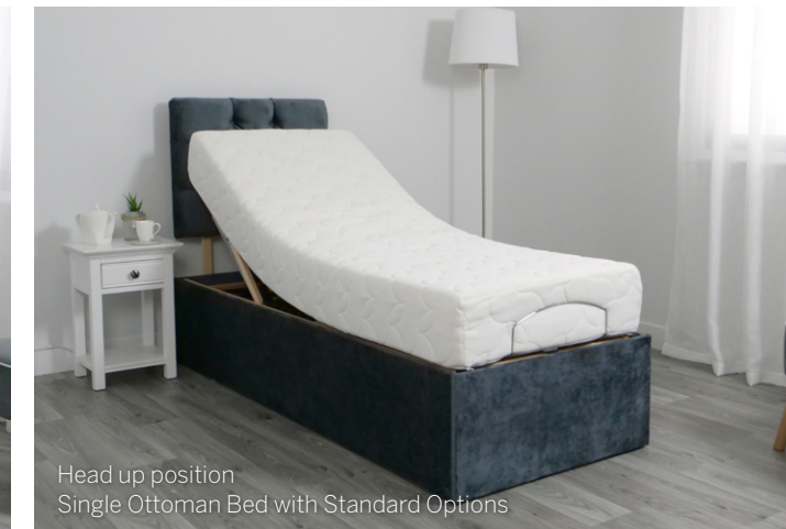
Head up position Single Ottoman Bed with Standard Options