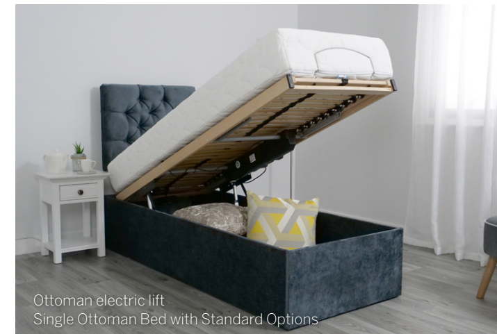
Ottoman electric lift Single Ottoman Bed with Standard Options