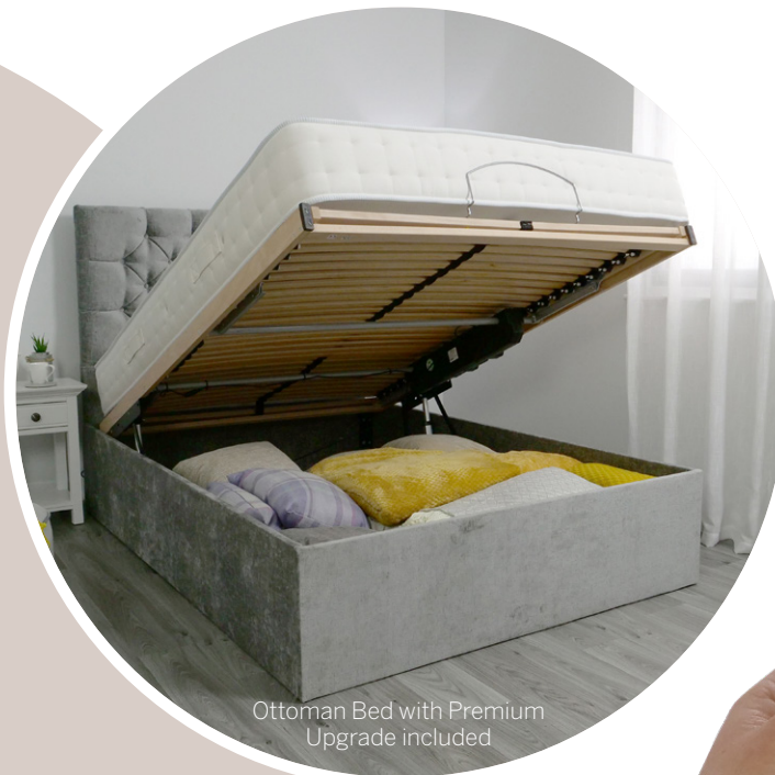
Ottoman Bed with Premium Upgrade included