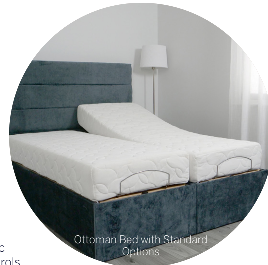
Ottoman Bed with Standard Options