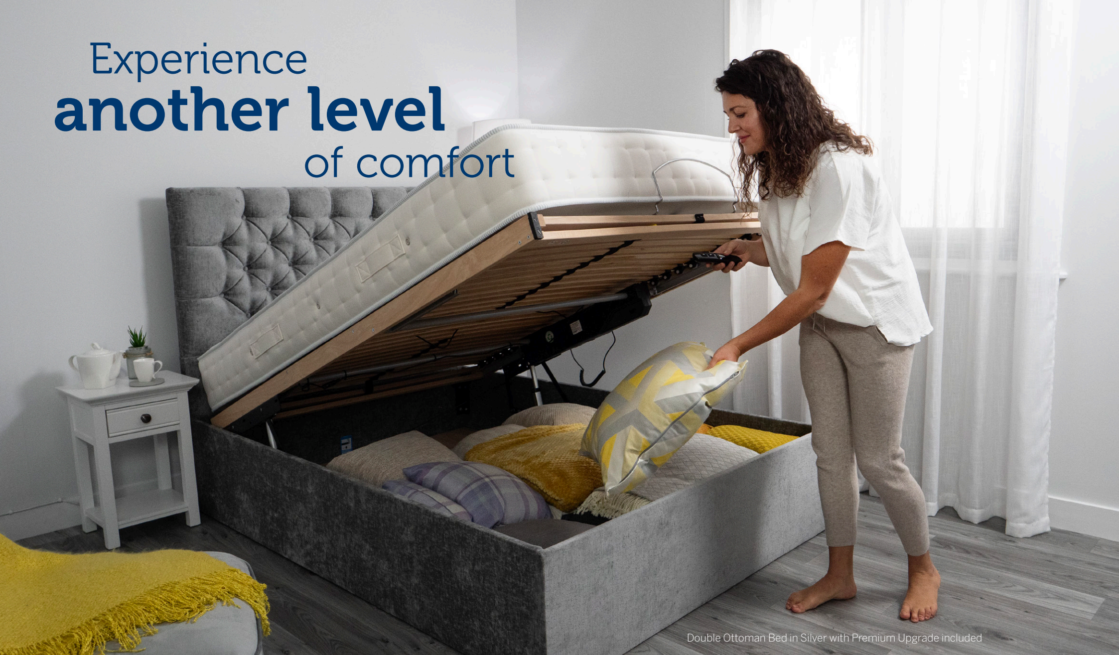
Double Ottoman Bed in Silver with Premium Upgrade included